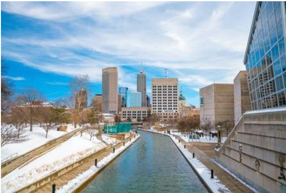
Downtown Indianapolis Canal in wintertime.